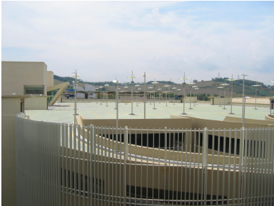
Alamanda Concrete Car park using Floormate 350 for traffic loading by WMK Sdn Bhd