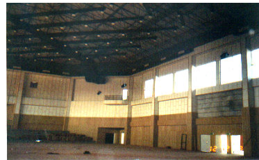
Kiara Indoor Stadium

Rain Noise Treatment Works and internal acoustic Wall panelling and ceiling works to Bukit Kiara Indoor Stadium, Sri Hartamas, Kuala Lumpur Dayareka Architects CCH Acoustic Consultant Kumpulan Kerjaya Sdn Bhd