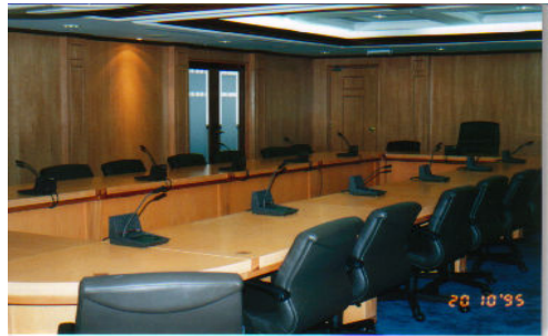
Puncak Niaga (M) SB, Plaza See Hoy Chan