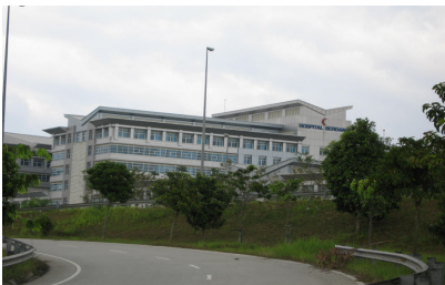
Serdang Hospital with Roofmate SL concrete flat roof application