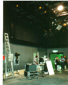
NTV Broadcasting Studios

Acoustic treatment works and Operable Wall at Mandarin Oriental Hotel Ballroom, Function Room 1 and 2, Jalan Ampang, Kuala Lumpur