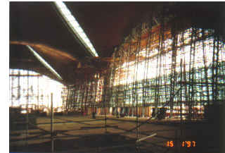
PTC1 – Main Terminal Building