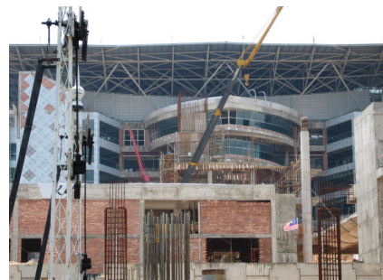
CIQ, Johor Baru Roofmate SL on concrete flat roof application