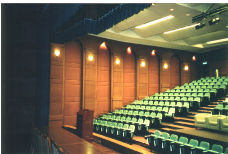
Auditorium at Putra Mosque

Architect FAA Acoustic Consultant Marshall Day Bersekutu Main Contractor Azastera Kobena JV