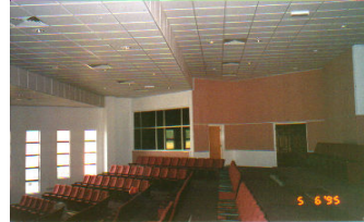
Ecophon S Line at RRM Auditorium

Acoustic Treatment Works and Interior Fit Out of Bowling Alley at Perangas Golf Club, Templer Park