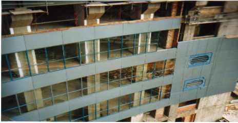
Menara Telekom – Fire Stops between floors

Fire stops and smoke seal works for floor to floor compartment Prevention of fire spread from Ground Floor to Level 59 of Menara Telekom, Jalan Bangsar, Kuala Lumpur Architect Hijjas Kasturi Client Global Wall (M) SB