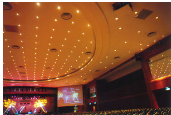
PGRM Auditorium – Concert Scene

Architect Gerareka Architect Interior Designer Axis Network Main Contractor Pembinaan Setia