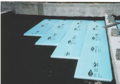
Precinct 20 Putra Jaya Roofmate SL for concrete flat roof application