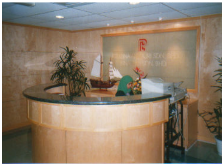
Bina Jati Sdn Bhd