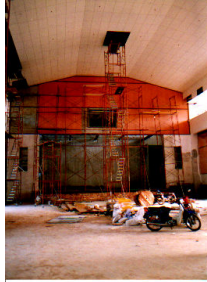
Constructing Over Stage Kuantan Sukan Belia

Acoustis Treatment Works for Multi Purpose Hall Including Rain Noise Treatment works to existing Roof at Kuantan Sukan Belia, Bandar Indera Mahkota, Kuantan, Pahang