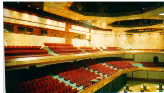
Dewan Merdeka, PWTC

Interior Refurbishment works including acoustic Design and treatment at Putra World Trade Centre at Dewan Merdeka Dewan Tun Dr Ismail Dewan Tun Hussein Onn All State Room Corporate Offices Client Putrade Property Management SB