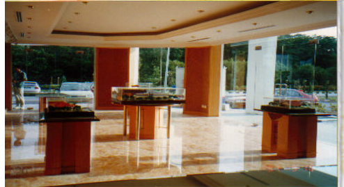
Bukit Cerakah Development SB, Shah Alam