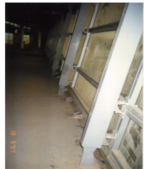
Fire Cavity Barriers